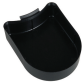
DRIP TRAY, TDO-N