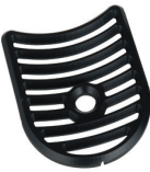
COVER, DRIP TDO-N