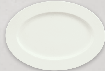
11 1/4" x 7 7/8" Oval Platter No. 9132029 H 7/8 6 pcs./8# = .2 cu. ft.