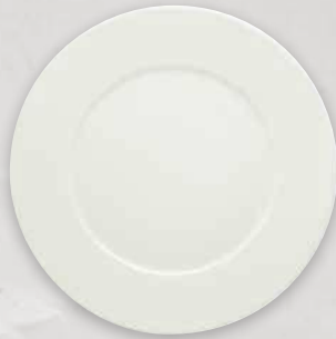
12 3/8" Plate, WR No. 9130031 H1 6 pcs./15# = .4 cu. ft.