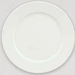
6 1/2" Plate No. 9130016 H 1/2 1 doz./5# = .1 cu. ft.