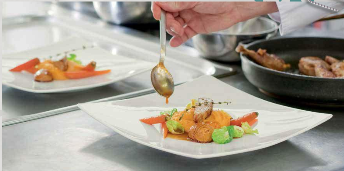
14 3/8" x 10" Oval Platter No. 9132036 H 1 1/8 6 pcs./15# = .3 cu. ft.