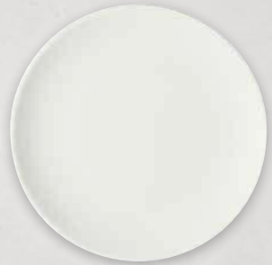
9 7/8" Plate No. 9130025 H1 6 pcs./8# = .2 cu. ft.