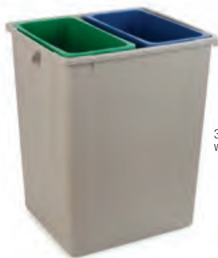
344042 with 23 gal TrimLines