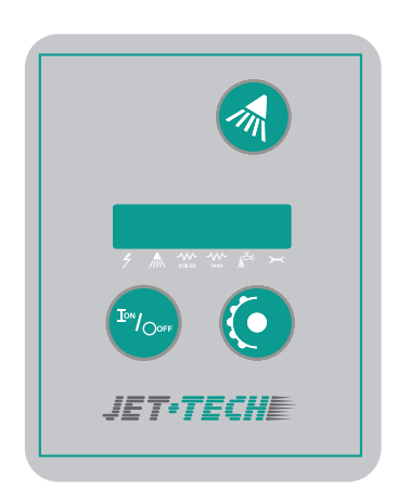
Low voltage soft touch control panel

CRP is the technology developed for end-users that expect absolute perfection. The CRP rinse permits you to enjoy the consistent quality results obtained; as the rinse water's temperature will not change for the total cycle duration. The water capacity and pressure are guaranteed by a built-in booster; not directly supplied from the incoming water line; but through an intermediate holding tank with a rinsing pump also located within the machine body as standard equipment.