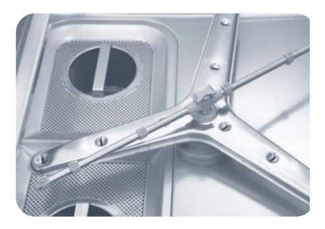
Wash & Rinse Arm Assembly

The 787 is very capable of washing large numbers of wares to allow the greatest flexibility of usage. Incorporating our exclusive half-load function; activating only one of two pumps saving valuable energy during slower periods. Three automatic programs ranging up to ten minute cycle lengths.