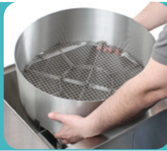
Conveyor easily lifts out for cleaning access.