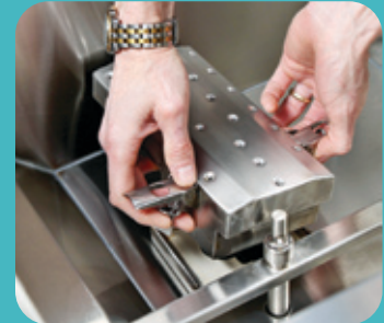
Stationary spray box simply unlatches for easy visual inspection and cleaning.