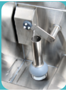
Drain stopper is controlled by a quiet and reliable gear motor with linkage cam instead of a noisy solenoid valve.