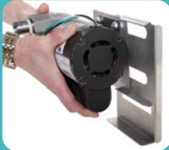
Special mounting bracket allows for easy service access to water recirculating pump.