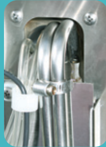
Incoming water line has built-in air gap so no separate vacuum breaker accessory is required.