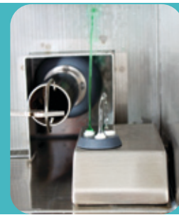
Chemical fill is easily visible by sliding the cover open during the fill portion of the wash and rinse cycle.