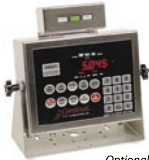
Optional Checkweigher Light Bar for Model 210