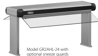
Model GR2AHL-24 with optional sneeze guards