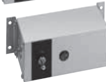
RMB-3F with toggle switch and indicator light

The infrared heating element shall be tubular metal sheathed. The foodwarmer shall be factory-assembled ready for electrical installation.