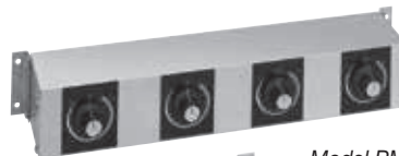
Model RMB-14E with infinite controls