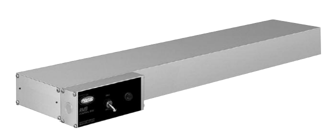
Model GRAM-18 with Control Enclosure with toggle switch and indicator light