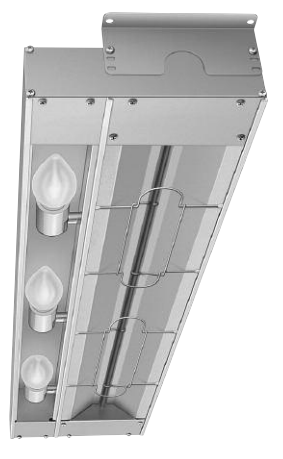
Model GRAML-36 with shatter-resistant incandescent lights, remote control enclosure (not pictured), and standard angle brackets