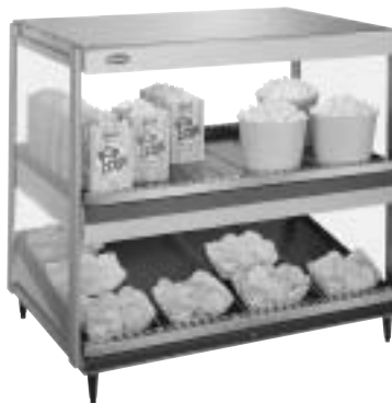
Model GRSDS/H-36D with slant shelf and horizontal shelf