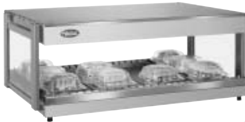
Model GRSDH-36 horizontal single shelf