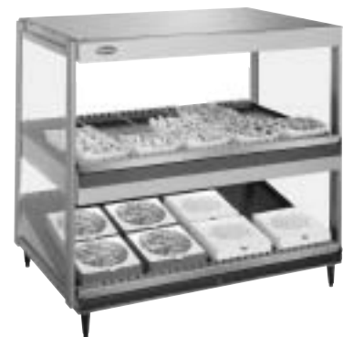
Model GRSDS/H-36DHW with slant shelf and horizontal shelf