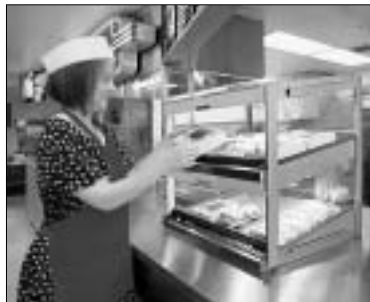
Model GRSDS-30D dual slant shelf with optional backlit merchandising sign and accessory display sign holder (signs not included)