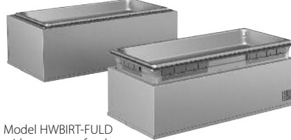
Model HWBIRT-FUL with accessory food pan