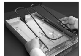
Quick access heating element and thermostat, for easy service