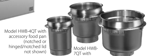
Model HWB-4QT with accessory food pan (notched or hinged/notched lid not shown)