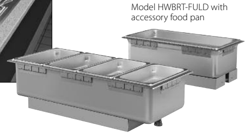
Model HWBRT-FUL with accessory food pan