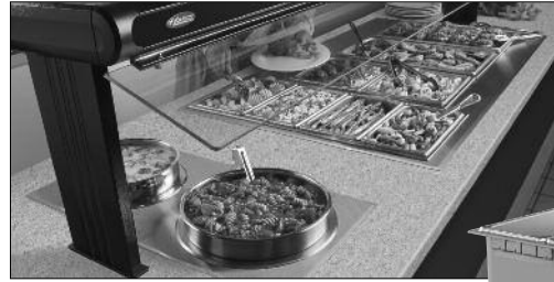
Model HWBIBRT-FUL with accessory food pan

*Fabricators will need to obtain UL approvals