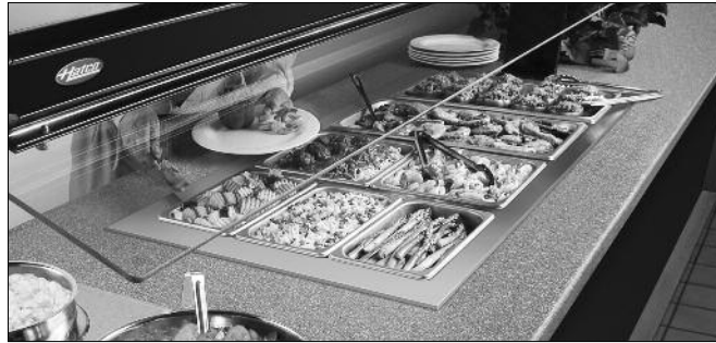
Model HWBI-4MA with accessory food pans

▲ For HWBI-FUL (HWBI-1) and HWBI-FULD (HWBI-1D), see Form No. HWBI-FUL Spec Sheet