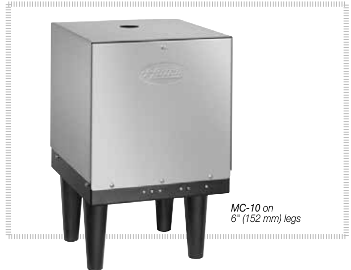
MC-10 on 6" (152 mm) legs