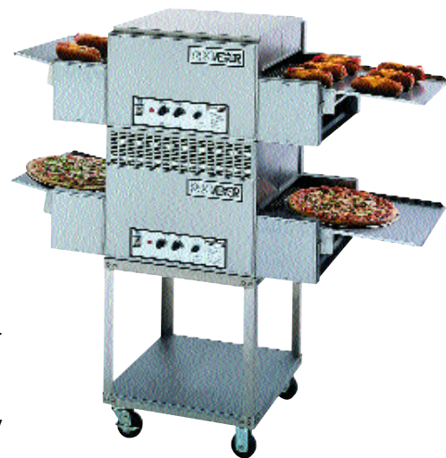
Model 314HX Stacked

Proveyor ovens are covered by Holman's one year parts and labor warranty.