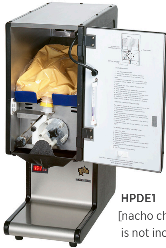
HPDE1 [nacho cheese is not included]

High Performance Dispenser with Portion Control HPDE1HP HPDE2HP