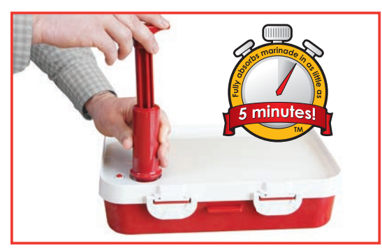
Quickly create vacuum pressure with included pump