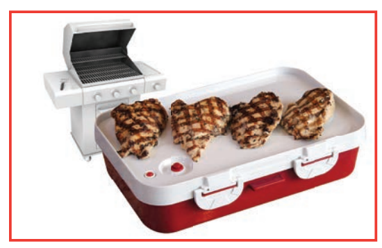
Sanitary PlatterCover™ for transporting food from grill