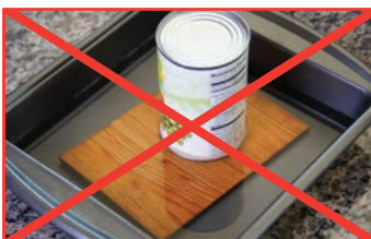
The old, messy and time consuming way to grill with cedar planks