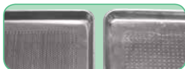
WINCO's "dense" perforation vs. others