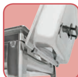
Handy lid clips hold lid in place