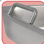
Patented Get-A-Grip handle system