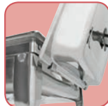
Handy lid clips hold lid in place