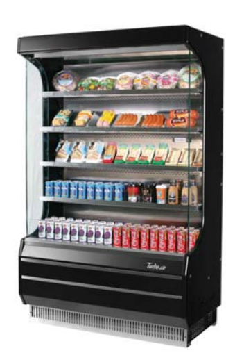
____ FEATURES & BENEFITS ____