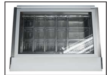
Glass Lid Top