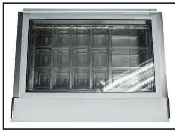
Glass Lid Top