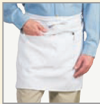
HALF BISTRO 607HBA2-WH