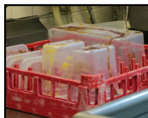
Dishwasher safe, Microwave Safe and BPA Free