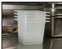
When not in use, nest together for compact storage