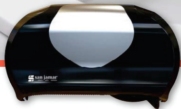
BLACK/STAINLESS LOOK - CLEAN, CONTEMPORARY, SLEEK