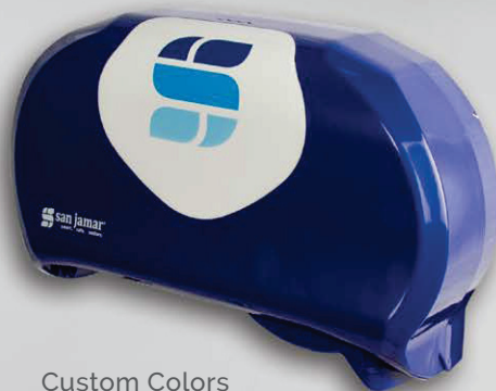
Custom Colors (see back page)

MAXIMUM OPTIONS COUNTLESS DESIGN OPPORTUNITIES