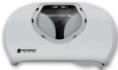
WHITE/CLEAR - CLEAN, CLASSIC, FRESH

Versatile dispenser is slim and compact, making it a perfect fit in any washroom.