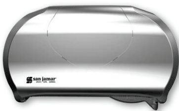
STAINLESS STEEL LOOK - HIGH END, VERSATILE, CLASSIC