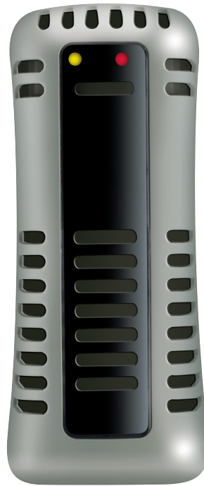
WF107 80 1204 (Gray) WF107 80 1206 (White)