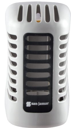
WP107 80 1202 (Gray) WP107 80 1203 (White)