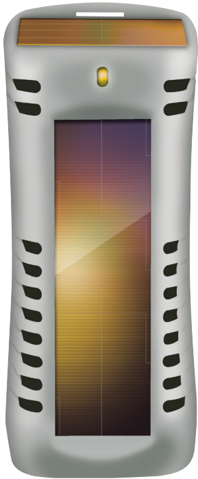
WS107 80 1207 (Gray) WS107 80 1208 (White)