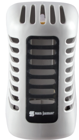
WP107 80 1202 (Gray) WP107 80 1203 (White)