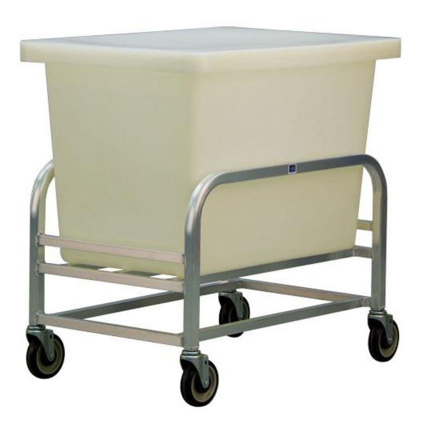
Model #99273 frame Model #0360 tub

These bulk movers carry a Lifetime Guarantee against rust and corrosion and also carry a Five-Year Guarantee against workmanship and material defects.