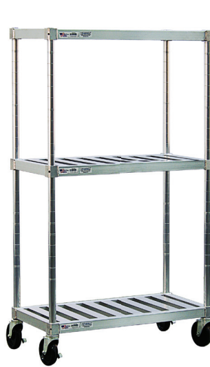
Adjustable Unit with Casters