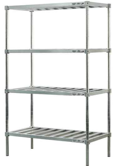
Adjustable Stationary Unit