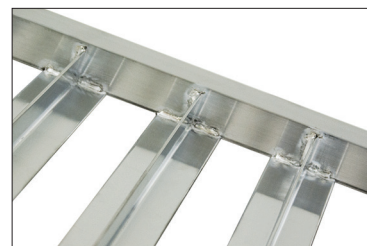
T-Bar. Shelf -- Underside

This information is for general sales and engineering use only. New Age Industrial reserves the right to modify or make changes at any time without notice to materials and specifications.