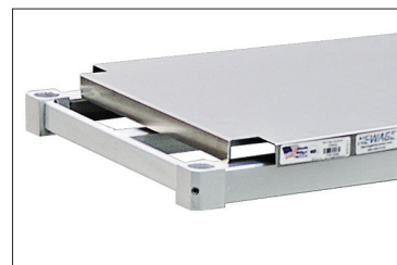
Solid Brute Shelf --Removable Top

This information is for general sales and engineering use only. New Age Industrial reserves the right to modify or make changes at any time without notice to materials and specifications.