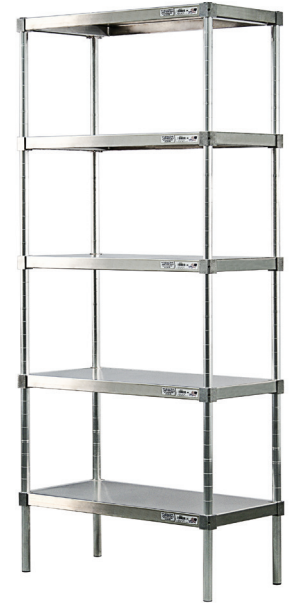
Adjustable Stationary Unit