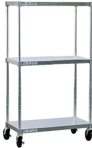
Adjustable Unit with Casters