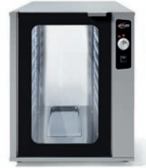
AX-PR5 SHIP WT: 133 lbs