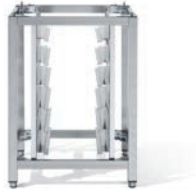
AX-501 OVEN STAND SHIP WT: 43 lbs