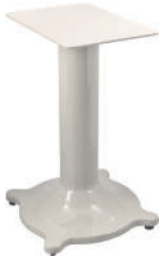
*Stand sold separately