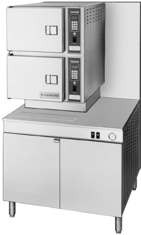
Shown with optional Electronic Timer