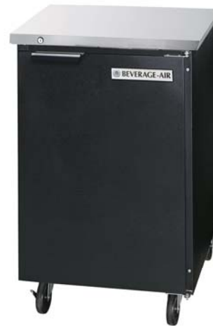
BB24 (black exterior with solid door shown)

NOTE: Unit standard on casters. It is not possible to order without casters.