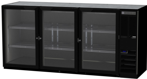
BB72HC-1-G-S (Black model shown)