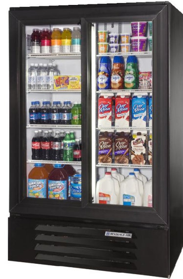
LV15-1-B (shown with optional fourth shelf)