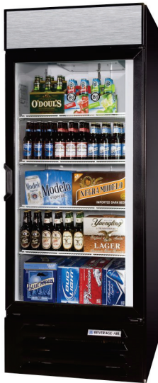
LV27HC-1-B (shown with 4 shelves)