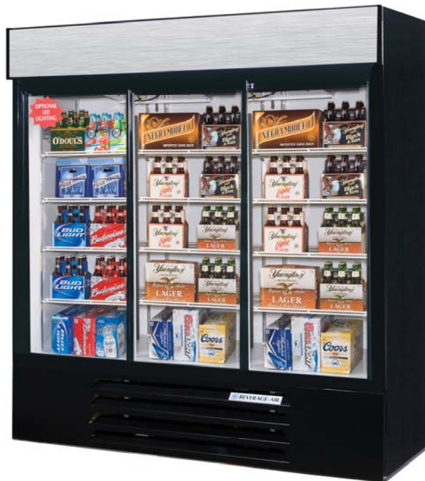
LV66Y-1-B (shown with 4 shelves per section)

MODEL: LV66Y-1-B LV66Y-1-W LV66Y-1-B-LED LV66Y-1-W-LED