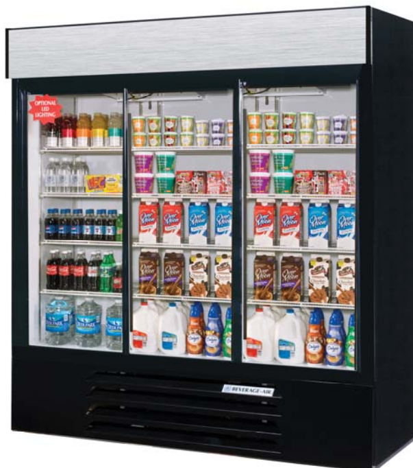
LV72Y-1-B (shown with 4 shelves per section)

MODEL: LV72Y-1-B LV72Y-1-W LV72Y-1-B-LED LV72Y-1-W-LED