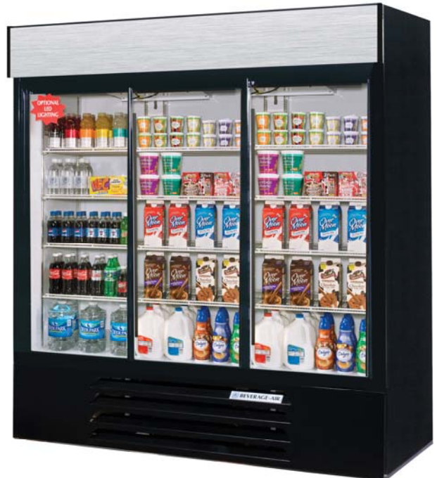
LV72Y-1-B (shown with 4 shelves per section)

Units wired at factory and ready for connection to a 115/60/1 phase, 15 amp dedicated outlet. 8' long cord and plug set included.