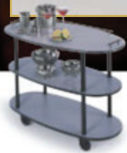
#36300 L in grey sand laminate