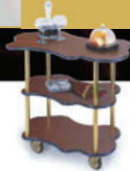
#36400 L in red maple laminate