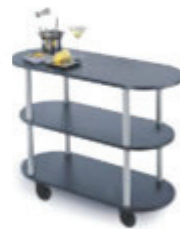
#36200 L in black laminate