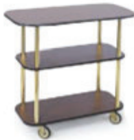
#36100 L in red maple laminate