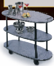
#36300 L in gray sand laminate