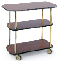
#36100 L in mahogany laminate