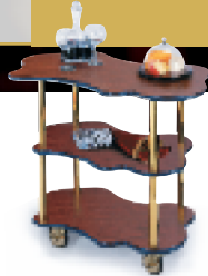
#36400 L in red maple laminate