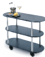
#36200 L in black laminate