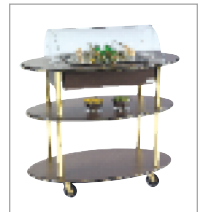
#36306 L in red mahogany laminate