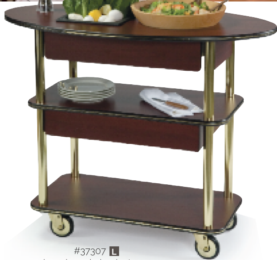
#37307 L in red maple laminate