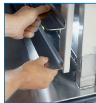
Removable Ledge Panels