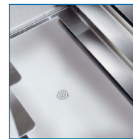
Interior Floor Drain