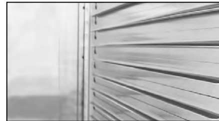
Extruded Channel Type Ledges