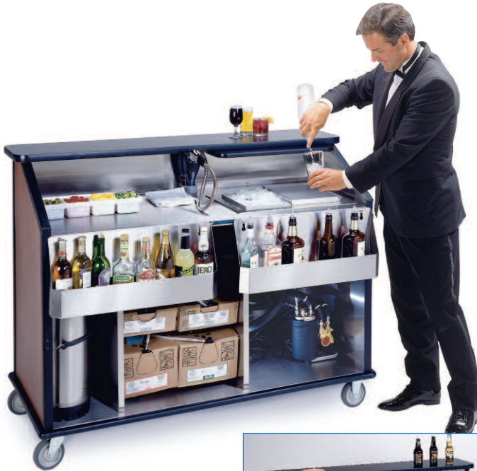
Model 889 shown with optional Post-Mix dispensing system and optional Bag-in Box rack kit.