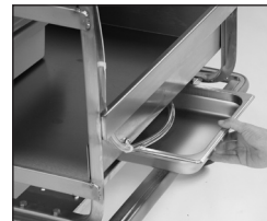
Drain Pan Holder