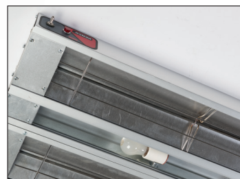
Optional showcase lighting adds visual appeal