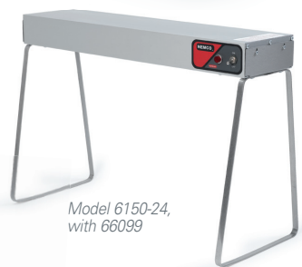
Model 6150-24, with 66099

Power option: Standard on/off toggle switch (shown) or 'infinite' temperature control dial for varying low, medium and high heat settings