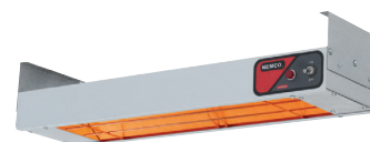
Model 6150-24, with hanging brackets