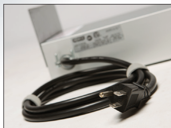
Optional cord-and-plug units simplify installation