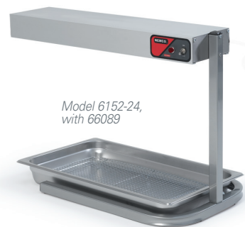
Model 6152-24, with 66089