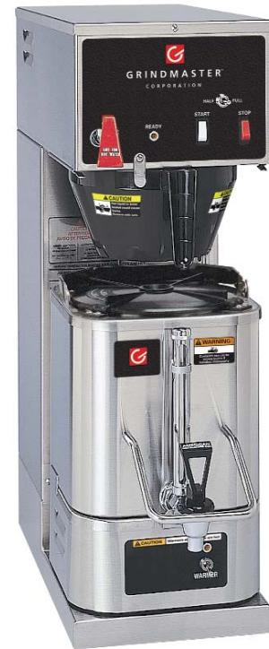
Model RAPS200 Shuttle®/Airpot Brewer

The P200 Shuttle® Brewer consistently delivers perfect coffee. Grindmaster's exclusive air gap insulated Shuttle® maintains the freshness and taste that your customers expect and allows you to transport and serve your coffee safely and easily.