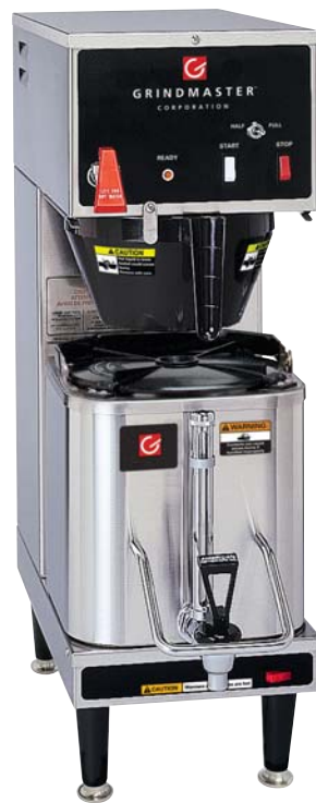
Model P200 Shuttle® Brewer