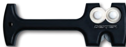
07921 EDGE-2 2-stage hand held knife sharpener