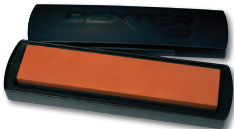
07945 EDGE-14 11½" Crystolon/India benchstone