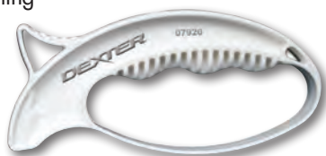
07920 EDGE-1 EZ edge hand held knife sharpener